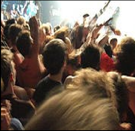
AUDIENCE MEMBERS AT A CONCERT MOSHING IN FRONT OF THE STAGE

Jesus says in Mark Chapter 7 beginning at verse 21, "For from within, [that is] out of the hearts of